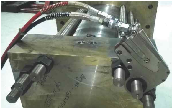
▲ PXD-4 Speedy torquing!

Clearance ABOVE The Nut - No Problem For A PXD! Clearance BEHIND The Nut - No Problem For A PXD! Clearance BETWEEN The Nut - No Problem For A PXD!