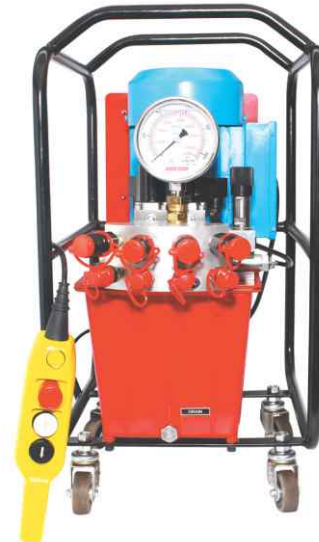
EP1000 with Quadra Port (4 Port)