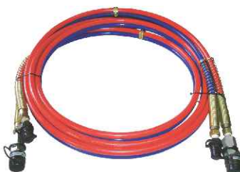
Hoses available in all lengths (15' hose standard with all pumps)