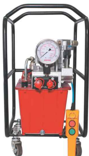
AP1000 with Mono Port