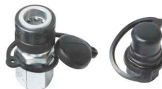
No-Drip Quick-Connect Couplers (Standard on all Powermaster America equipment)