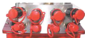
Quadra-Port (Multi-Port Manifold (Max. 4 Ports))