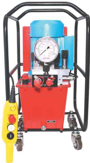
EP1000 with Mono Port