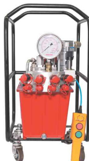
AP1000 with Quadra Port (4 Port)